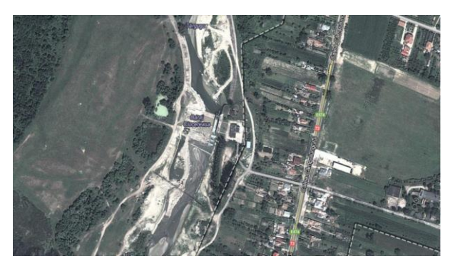
Figure 3. Dam area satellite view

This is obtained by introducing an amount of mettalic fibres ( 80 \text{ kg/m}^3 ) in the moment the concrete shall be prepaired.